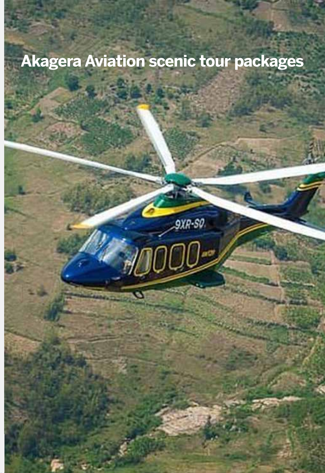
Akagera Aviation scenic tour packages